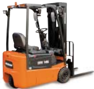
B10R-5 / B13R-5 / B15R-5 / B16R-5 1,000kg to 1,600kg Capacity 24VOLT Pneumatic & Solid Tire